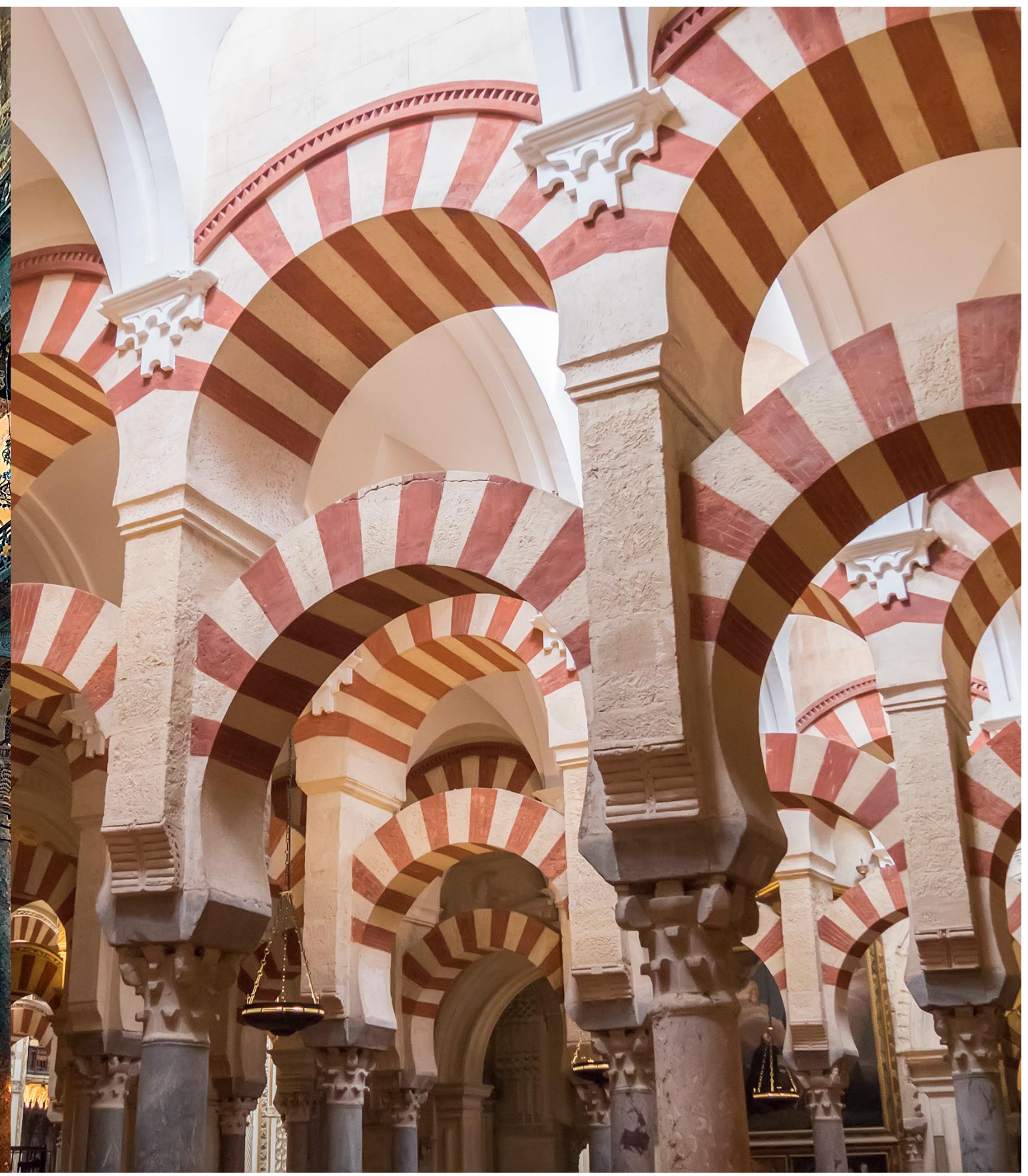
Mosque-Cathedral of Córdoba, Álvaro Trabazo Rivas